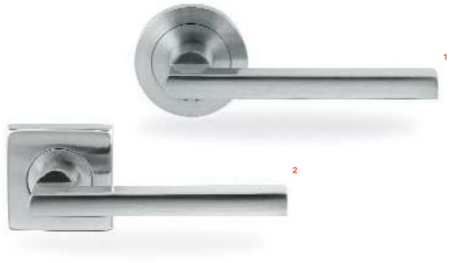
CIRO design by Hugo Workshop